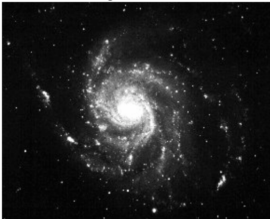
M101 The Pinwheel Galaxy

4. These are 2 galaxies that we cannot use in our search for dark matter.