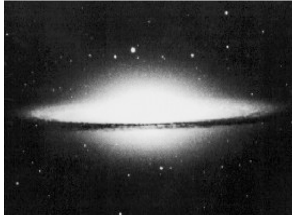
M104 The Sombrero