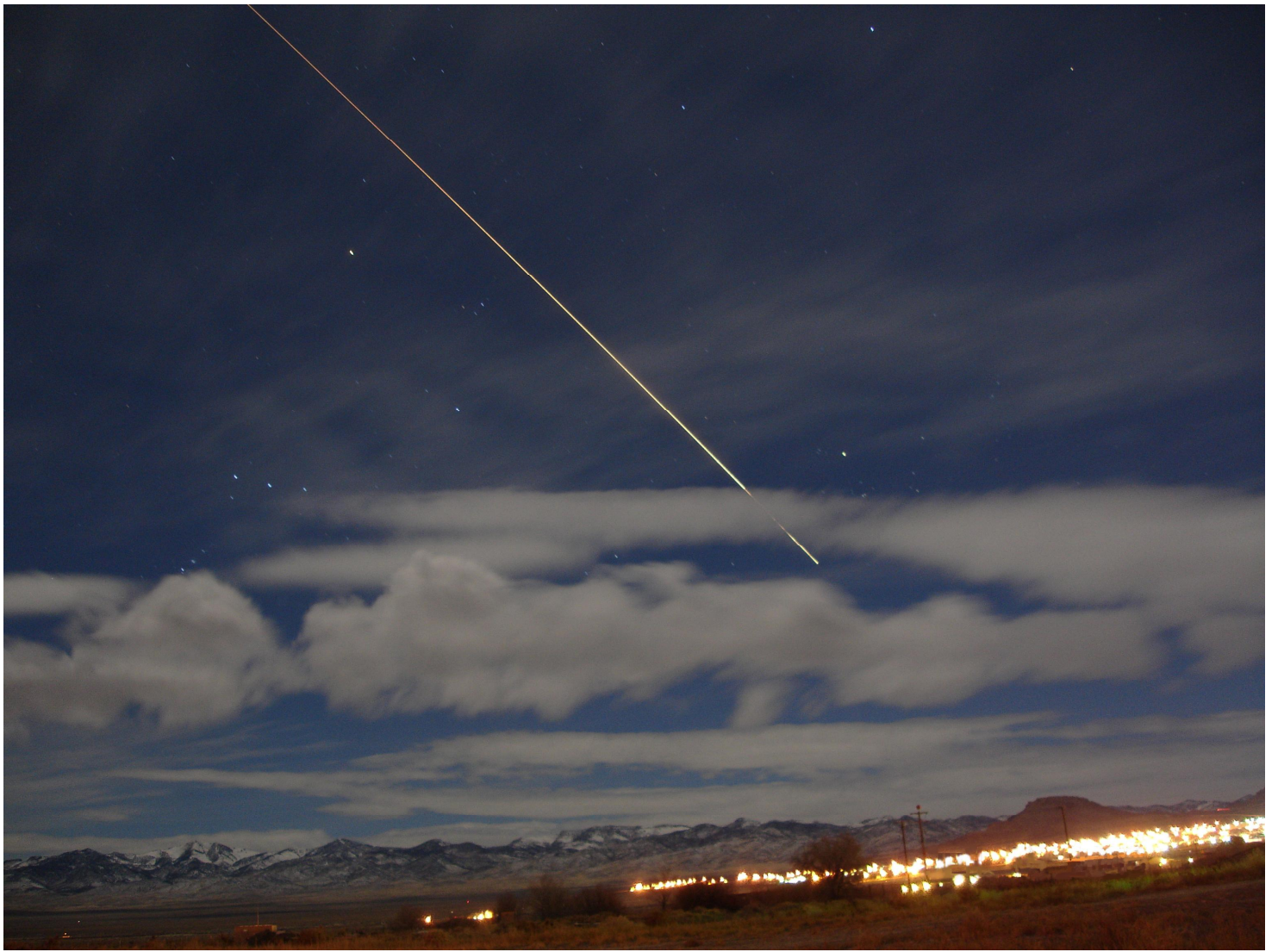
Stardust Re-entry.