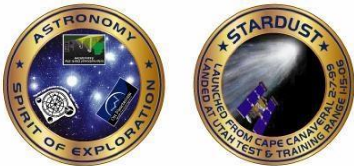
Picture of the Stardust Coin.